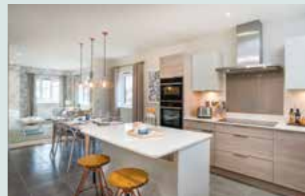
Images from previous Seaward development