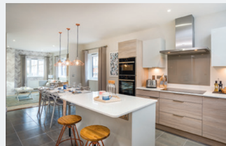
Images from previous Seaward development