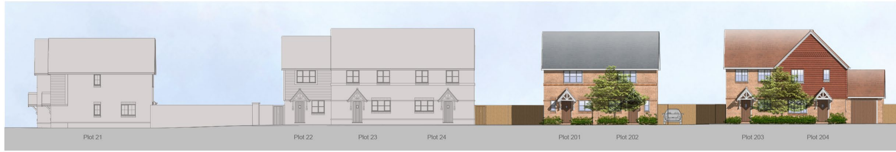
Proposed - Section 1