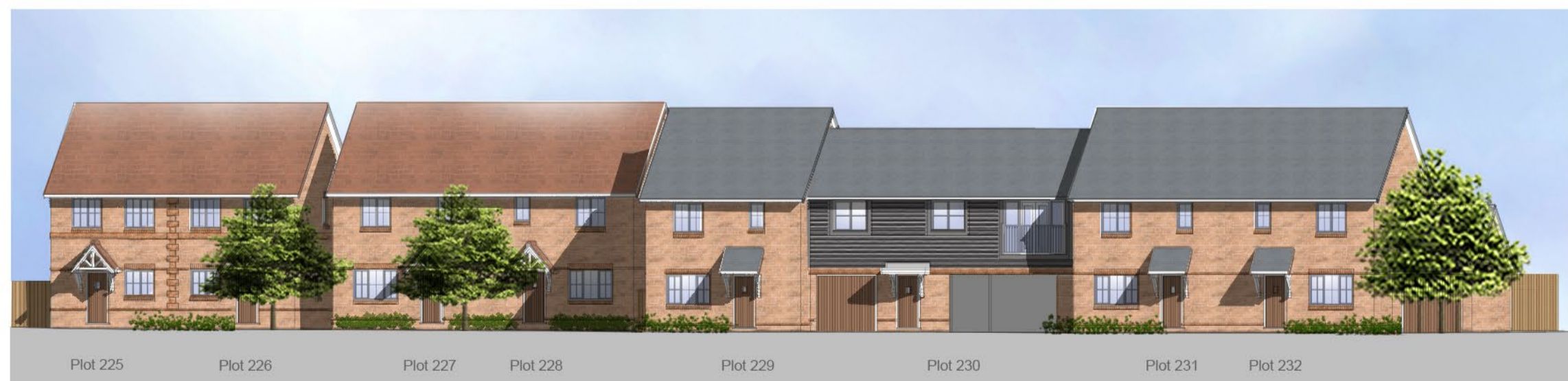
Proposed - Section 6