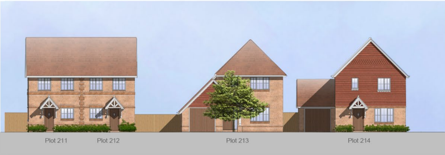
Proposed - Section 3