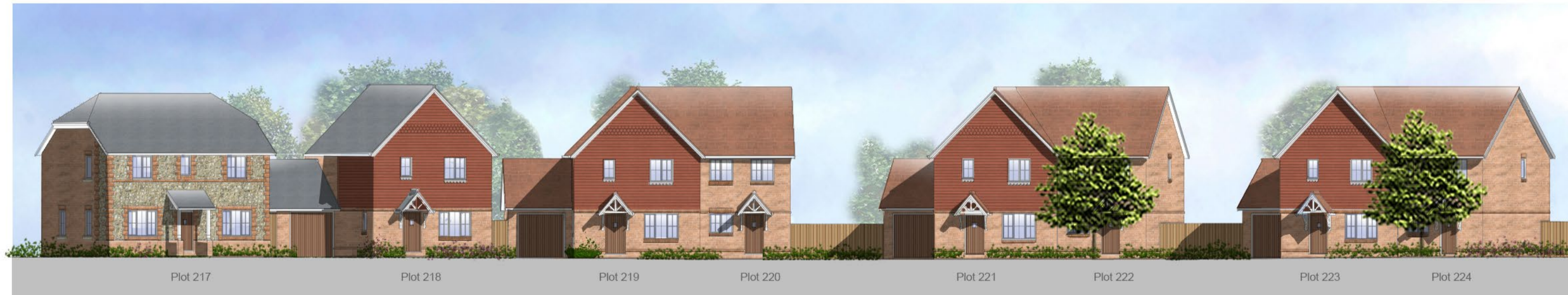
Proposed - Section 5