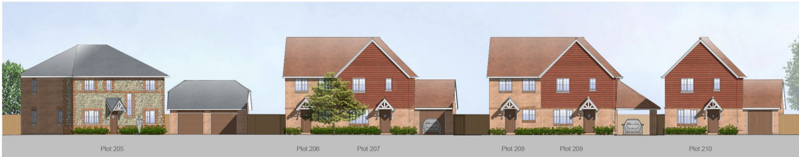
Proposed - Section 2