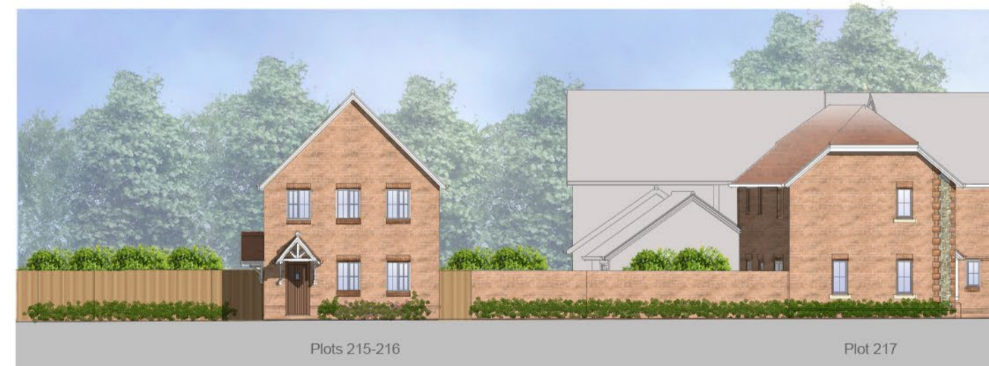
Proposed - Section 7