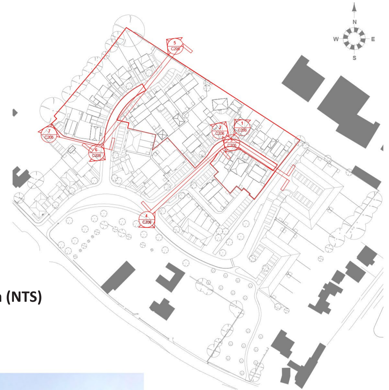
Key Plan (NTS)