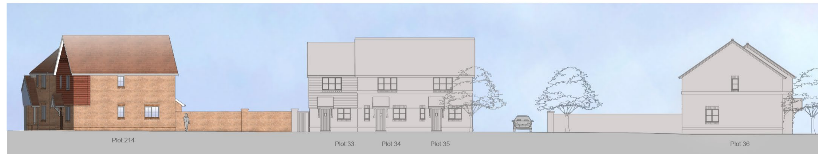
Proposed - Section 4